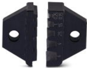
Spare die for CRIMPFOX 6

Please be informed that the data shown in this PDF Document is generated from our Online Catalog. Please find the complete data in the user's documentation. Our General Terms of Use for Downloads are valid ( http://phoenixcontact.com/download )