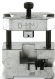
10-pos. replacement die

Please be informed that the data shown in this PDF Document is generated from our Online Catalog. Please find the complete data in the user's documentation. Our General Terms of Use for Downloads are valid ( http://phoenixcontact.com/download )