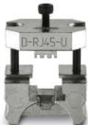
Die, for unshielded RJ45 plugs, universal

Please be informed that the data shown in this PDF Document is generated from our Online Catalog. Please find the complete data in the user's documentation. Our General Terms of Use for Downloads are valid ( http://phoenixcontact.com/download )