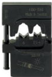
Die, for MC3 solar connectors, lateral entry, 2.5 ... 6 mm 2

Please be informed that the data shown in this PDF Document is generated from our Online Catalog. Please find the complete data in the user's documentation. Our General Terms of Use for Downloads are valid ( http://phoenixcontact.com/download )