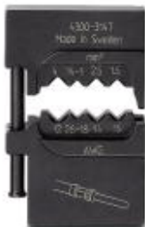
Die, for Crimpfox-M, for turned contacts 0.5 ... 4 mm 2 , packed in a serial storage box

Please be informed that the data shown in this PDF Document is generated from our Online Catalog. Please find the complete data in the user's documentation. Our General Terms of Use for Downloads are valid ( http://phoenixcontact.com/download )