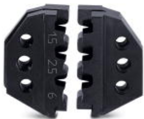
Spare die for CRIMPFOX-SC 6

Please be informed that the data shown in this PDF Document is generated from our Online Catalog. Please find the complete data in the user's documentation. Our General Terms of Use for Downloads are valid ( http://phoenixcontact.com/download )