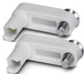
Replacement cable guide 0.5 mm 2 , for sleeve feed CF 3000 HZG 0,5

Please be informed that the data shown in this PDF Document is generated from our Online Catalog. Please find the complete data in the user's documentation. Our General Terms of Use for Downloads are valid ( http://phoenixcontact.com/download )