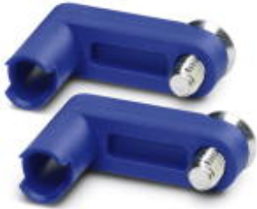
Replacement cable guide 2.5 mm 2 , for sleeve feed CF 3000 HZG 2,5

Please be informed that the data shown in this PDF Document is generated from our Online Catalog. Please find the complete data in the user's documentation. Our General Terms of Use for Downloads are valid ( http://phoenixcontact.com/download )