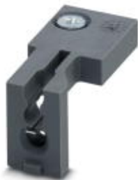
Sleeve receiver for 0.75 mm 2 sleeves

Please be informed that the data shown in this PDF Document is generated from our Online Catalog. Please find the complete data in the user's documentation. Our General Terms of Use for Downloads are valid ( http://phoenixcontact.com/download )