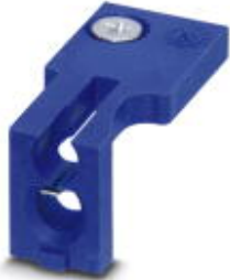
Sleeve receiver for 2.5 mm 2 sleeves

Please be informed that the data shown in this PDF Document is generated from our Online Catalog. Please find the complete data in the user's documentation. Our General Terms of Use for Downloads are valid ( http://phoenixcontact.com/download )