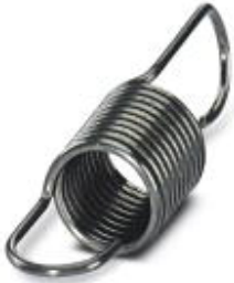
Spare recuperating spring

Please be informed that the data shown in this PDF Document is generated from our Online Catalog. Please find the complete data in the user's documentation. Our General Terms of Use for Downloads are valid ( http://phoenixcontact.com/download )