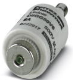
Fuse insert, nominal current: 6 A, length: 50 mm, diameter: 22 mm, color: green

Please be informed that the data shown in this PDF Document is generated from our Online Catalog. Please find the complete data in the user's documentation. Our General Terms of Use for Downloads are valid ( http://phoenixcontact.com/download )