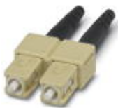
SC duplex connector, with bend protection, for 200/230 \mu\text{m} , 50/200/230 \mu\text{m} , and 62.5/200/230 \mu\text{m} PCF fibers