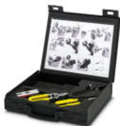
Tool set for PCF assembly, for 200/230 µm, 50/200/230 µm, and 62.5/200/230 µm PCF fibers

Please be informed that the data shown in this PDF Document is generated from our Online Catalog. Please find the complete data in the user's documentation. Our General Terms of Use for Downloads are valid ( http://phoenixcontact.com/download )