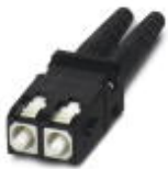
SC-RJ connector, with bend protection, for 200/230 \mu\text{m} , 50/200/230 \mu\text{m} , and 62.5/200/230 \mu\text{m} PCF fibers