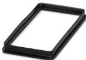
Profile gasket for sleeve housing type B10.....EEE

Please be informed that the data shown in this PDF Document is generated from our Online Catalog. Please find the complete data in the user's documentation. Our General Terms of Use for Downloads are valid ( http://phoenixcontact.com/download )