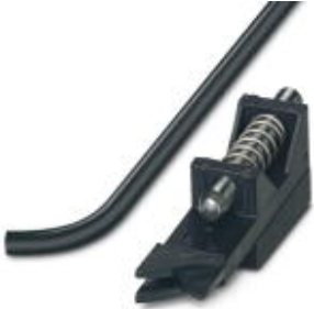
Replacement centering fork (top), for the crimping device CF 3000-2,5

Please be informed that the data shown in this PDF Document is generated from our Online Catalog. Please find the complete data in the user's documentation. Our General Terms of Use for Downloads are valid ( http://phoenixcontact.com/download )