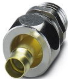
Cable gland made from brass with Pg thread, IP40 protection

Please be informed that the data shown in this PDF Document is generated from our Online Catalog. Please find the complete data in the user's documentation. Our General Terms of Use for Downloads are valid ( http://phoenixcontact.com/download )