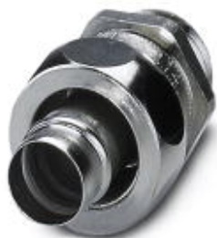
Cable gland made from brass with Pg thread, IP40 protection

Please be informed that the data shown in this PDF Document is generated from our Online Catalog. Please find the complete data in the user's documentation. Our General Terms of Use for Downloads are valid ( http://phoenixcontact.com/download )