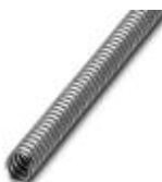
Protective hose in stainless steel

Protective hose - WP-STEEL S 14 - 3240687