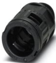
Cable gland, metric thread, IP66 protection, straight

Please be informed that the data shown in this PDF Document is generated from our Online Catalog. Please find the complete data in the user's documentation. Our General Terms of Use for Downloads are valid ( http://phoenixcontact.com/download )