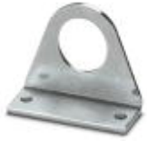
Fixing bracket for protective sleeves, fixed with two screws

Protective hose fixing bracket - WP-BASE A M20 - 3241084