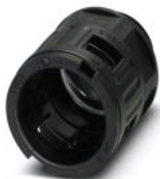
Cable gland, metric thread, IP66 protection, straight

Please be informed that the data shown in this PDF Document is generated from our Online Catalog. Please find the complete data in the user's documentation. Our General Terms of Use for Downloads are valid ( http://phoenixcontact.com/download )