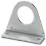
Fixing bracket for protective sleeves, fixed with two screws

Protective hose fixing bracket - WP-BASE A M25 - 3241085