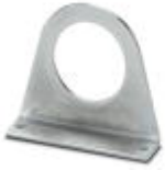
Fixing bracket for protective sleeves, fixed with two screws

Protective hose fixing bracket - WP-BASE A M40 - 3241087