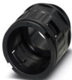
Cable gland, metric thread, IP66 protection, straight

Please be informed that the data shown in this PDF Document is generated from our Online Catalog. Please find the complete data in the user's documentation. Our General Terms of Use for Downloads are valid ( http://phoenixcontact.com/download )