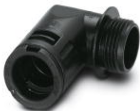
Cable gland, Pg thread, IP66 protection, angled

Please be informed that the data shown in this PDF Document is generated from our Online Catalog. Please find the complete data in the user's documentation. Our General Terms of Use for Downloads are valid ( http://phoenixcontact.com/download )