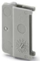
Path extension, color: gray

Please be informed that the data shown in this PDF Document is generated from our Online Catalog. Please find the complete data in the user's documentation. Our General Terms of Use for Downloads are valid ( http://phoenixcontact.com/download )