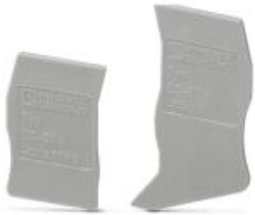
Cover segment, length: 87 mm, height: 36.5 mm, color: gray

Please be informed that the data shown in this PDF Document is generated from our Online Catalog. Please find the complete data in the user's documentation. Our General Terms of Use for Downloads are valid ( http://phoenixcontact.com/download )