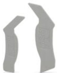
Cover segment, color: gray

Please be informed that the data shown in this PDF Document is generated from our Online Catalog. Please find the complete data in the user's documentation. Our General Terms of Use for Downloads are valid ( http://phoenixcontact.com/download )