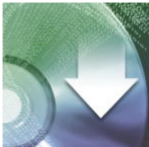
License for mGuard Secure VPN Client v11.x

Please be informed that the data shown in this PDF Document is generated from our Online Catalog. Please find the complete data in the user's documentation. Our General Terms of Use for Downloads are valid ( http://phoenixcontact.com/download )