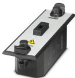
CHECKMASTER 2 test adapter for the CTM product range

Please be informed that the data shown in this PDF Document is generated from our Online Catalog. Please find the complete data in the user's documentation. Our General Terms of Use for Downloads are valid ( http://phoenixcontact.com/download )