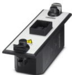
CHECKMASTER 2 test adapter for the PT and PLT-SEC product ranges, 35 mm

Please be informed that the data shown in this PDF Document is generated from our Online Catalog. Please find the complete data in the user's documentation. Our General Terms of Use for Downloads are valid ( http://phoenixcontact.com/download )