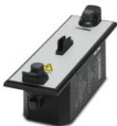
CHECKMASTER 2 test adapter for the TTC product range.

Please be informed that the data shown in this PDF Document is generated from our Online Catalog. Please find the complete data in the user's documentation. Our General Terms of Use for Downloads are valid ( http://phoenixcontact.com/download )