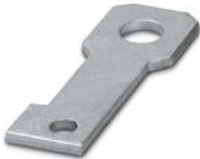
Plate for fixing the FLT-ISG-100-EX isolating spark gap to a flange, drill hole diameter of 18 mm.

Please be informed that the data shown in this PDF Document is generated from our Online Catalog. Please find the complete data in the user's documentation. Our General Terms of Use for Downloads are valid ( http://phoenixcontact.com/download )