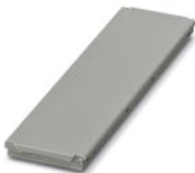
Installation component housing, Cover, width: 161.6 mm, height: 45 mm, Depth: 8 mm, color: light gray (7035)

Please be informed that the data shown in this PDF Document is generated from our Online Catalog. Please find the complete data in the user's documentation. Our General Terms of Use for Downloads are valid ( http://phoenixcontact.com/download )