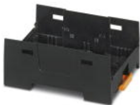
DIN rail housing, Lower housing part with base latch, flat design, width: 52.6 mm, height: 75 mm, Depth: 30.3 mm, color: black (9005)

Please be informed that the data shown in this PDF Document is generated from our Online Catalog. Please find the complete data in the user's documentation. Our General Terms of Use for Downloads are valid ( http://phoenixcontact.com/download )