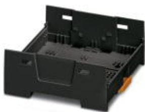
DIN rail housing, Lower housing part with base latch, flat design, width: 70.1 mm, height: 75 mm, Depth: 30.3 mm, color: black (9005)

Please be informed that the data shown in this PDF Document is generated from our Online Catalog. Please find the complete data in the user's documentation. Our General Terms of Use for Downloads are valid ( http://phoenixcontact.com/download )