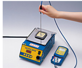
A1310 Solder Pot Probe