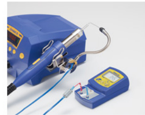
C1541 Hot Air Station Probe