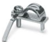
Shield connection clamp for printed circuit terminal block

Shield connection clamp - ME-SAS - 2853899