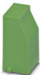
DIN rail housing, Filler plug for unoccupied terminal points, color: green (6021)

Please be informed that the data shown in this PDF Document is generated from our Online Catalog. Please find the complete data in the user's documentation. Our General Terms of Use for Downloads are valid ( http://phoenixcontact.com/download )