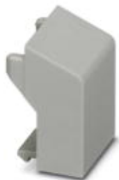
DIN rail housing, Filler plug for unoccupied terminal points, color: light gray (7035)

Please be informed that the data shown in this PDF Document is generated from our Online Catalog. Please find the complete data in the user's documentation. Our General Terms of Use for Downloads are valid ( http://phoenixcontact.com/download )