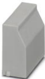
DIN rail housing, Filler plug for unoccupied terminal points, color: light gray (7035)

Please be informed that the data shown in this PDF Document is generated from our Online Catalog. Please find the complete data in the user's documentation. Our General Terms of Use for Downloads are valid ( http://phoenixcontact.com/download )