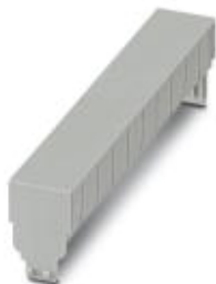
DIN rail housing, 10U, Housing cover, width: 18.9 mm, height: 109.8 mm, color: light gray (7035)

Please be informed that the data shown in this PDF Document is generated from our Online Catalog. Please find the complete data in the user's documentation. Our General Terms of Use for Downloads are valid ( http://phoenixcontact.com/download )