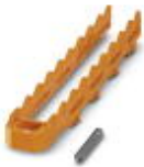
DIN rail housing, 9U, Lock and Release system, width: 16.1 mm, height: 111.8 mm, depth: 8.8 mm, color: orange (2003)