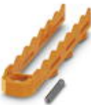
DIN rail housing, 7U, Lock and Release system, width: 16.1 mm, height: 89.95 mm, depth: 8.8 mm, color: orange (2003)