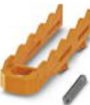
DIN rail housing, 5U, Lock and Release system, width: 16.1 mm, height: 67.95 mm, depth: 8.8 mm