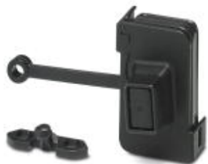
Protective covers, degree of protection: IP65/IP67

Please be informed that the data shown in this PDF Document is generated from our Online Catalog. Please find the complete data in the user's documentation. Our General Terms of Use for Downloads are valid ( http://phoenixcontact.com/download )