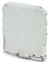
DIN rail housing, Complete housing with metal foot catch, tall design, with vents, width: 12.5 mm, height: 99 mm, depth: 114.5 mm, color: light gray (7035)

Please be informed that the data shown in this PDF Document is generated from our Online Catalog. Please find the complete data in the user's documentation. Our General Terms of Use for Downloads are valid ( http://phoenixcontact.com/download )