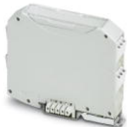
DIN rail housing, Ultra-flat design, without vents, width: 17.5 mm, height: 85 mm, depth: 70.4 mm, color: light gray (7035)

Please be informed that the data shown in this PDF Document is generated from our Online Catalog. Please find the complete data in the user's documentation. Our General Terms of Use for Downloads are valid ( http://phoenixcontact.com/download )