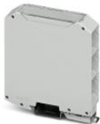
Complete housing, Flat design, without vents, width: 22.5 mm, depth: 85 mm

Please be informed that the data shown in this PDF Document is generated from our Online Catalog. Please find the complete data in the user's documentation. Our General Terms of Use for Downloads are valid ( http://phoenixcontact.com/download )