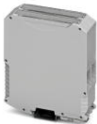
DIN rail housing, Complete housing with metal foot catch, tall design, without vents, width: 35 mm, height: 99 mm, depth: 114.5 mm, color: light gray (7035)

Please be informed that the data shown in this PDF Document is generated from our Online Catalog. Please find the complete data in the user's documentation. Our General Terms of Use for Downloads are valid ( http://phoenixcontact.com/download )