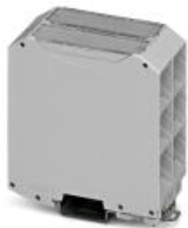
DIN rail housing, Complete housing with metal foot catch, flat design, without vents, width: 45 mm, height: 85 mm, depth: 92 mm, color: light gray (7035)

Please be informed that the data shown in this PDF Document is generated from our Online Catalog. Please find the complete data in the user's documentation. Our General Terms of Use for Downloads are valid ( http://phoenixcontact.com/download )