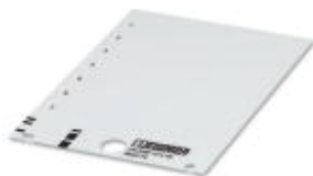
The figure shows a version of the product

Snap-in markers, Card, silver, unlabeled, can be labeled with: BLUEMARK ID COLOR, BLUEMARK ID, THERMOMARK PRIME, THERMOMARK CARD 2.0, THERMOMARK CARD, mounting type: snapped into marker carrier, lettering field size: 27 x 8 mm, Number of individual labels: 51