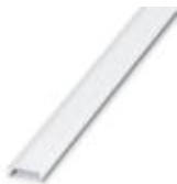
Cover, transparent, unlabeled, lettering field size: 1000 x 15 mm

Cover - CARRIER-EMP (1000X15) COVER - 0829520