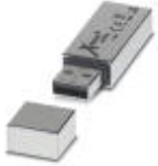
USB memory stick, 8 GB

USB memory stick - USB FLASH DRIVE - 2402809