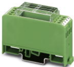
Diode module, with 4 diodes, individually wired, diode type 1N 4007

Please be informed that the data shown in this PDF Document is generated from our Online Catalog. Please find the complete data in the user's documentation. Our General Terms of Use for Downloads are valid ( http://phoenixcontact.com/download )