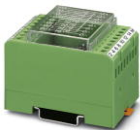
Lamp test module, 2 diodes with common cathode: with 7 pairs, with common triggering

Please be informed that the data shown in this PDF Document is generated from our Online Catalog. Please find the complete data in the user's documentation. Our General Terms of Use for Downloads are valid ( http://phoenixcontact.com/download )